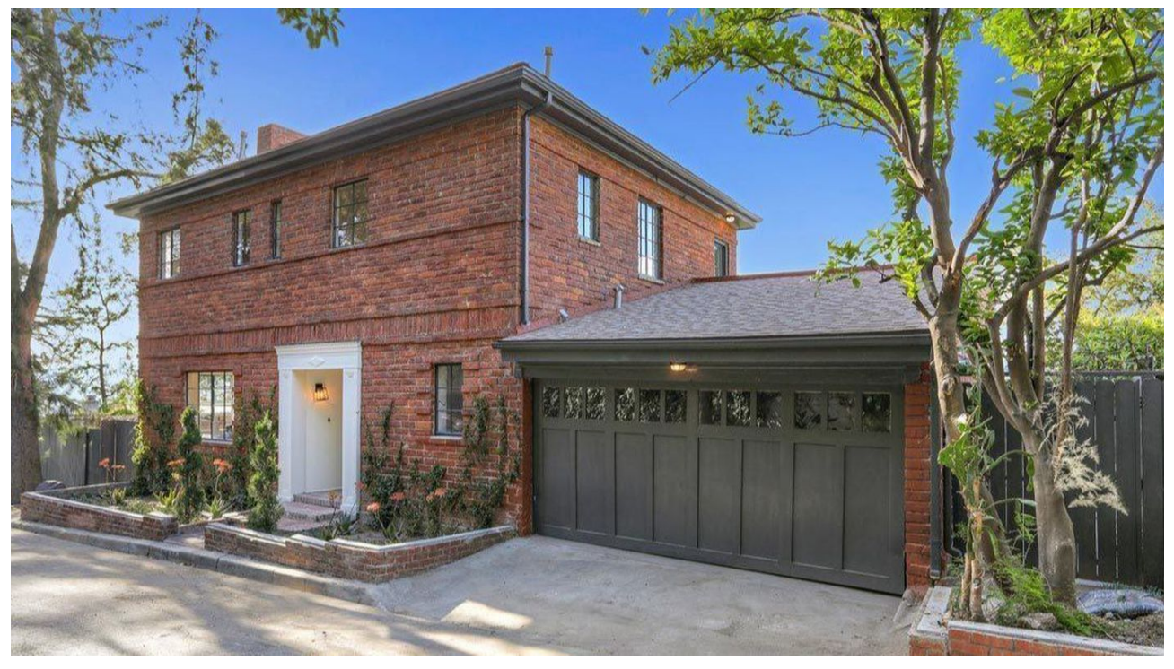
This brick Colonial Revival-style house sold in September for $2.5 million.

Silver Lake's year in real estate included more than 180 single-family home sales of $1 million or more, besting the 2016 total by roughly 50 sales. There were 16 sales of $2 million or more in 2017, up from 11 sales the previous year.