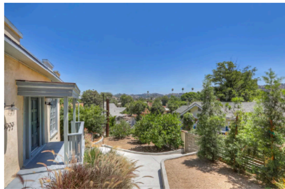
The home is perched above the street, providing nice hillside views from the front yard.

https://la.curbed.com/2019/8/9/20797592/highland-park-house-for-sale