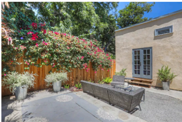
The lot is small, measuring a compact 2,300 square feet.