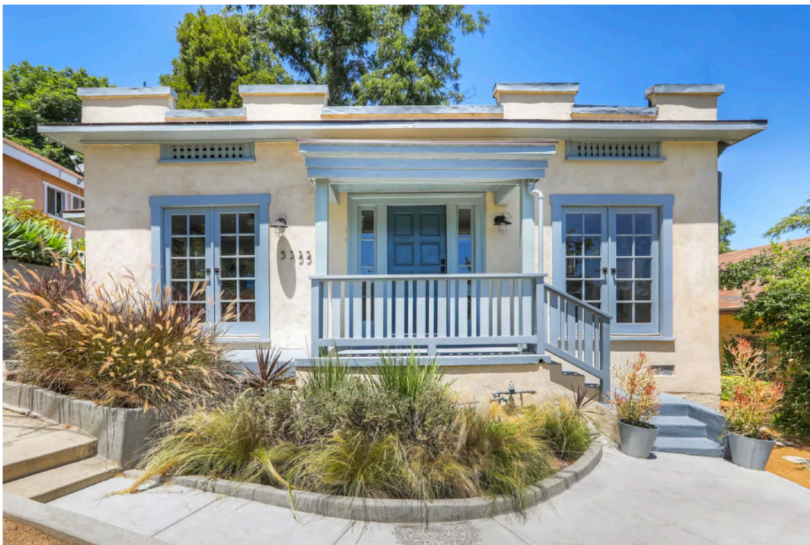
The dwelling was built in 1921. | Courtesy of Tracy Do/Compass

By Jenna Chandler | @jennakchandler | Aug 9, 2019, 9:12am PDT