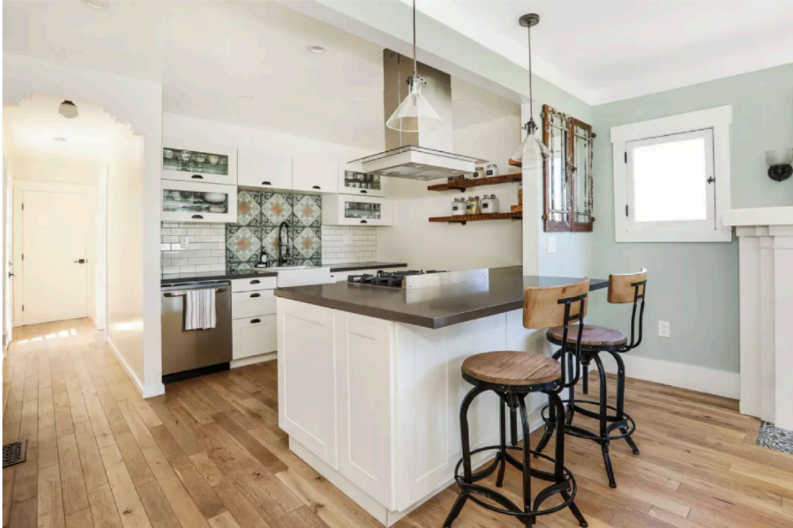
The kitchen sports new appliances, cabinets, and tile.

Perched above Avenue 54, along the Granada Stairs , 5335 Granada Street also boasts some pretty hilltop views and is walking distance to the cafes, bars, and restaurants on Figueroa Street. It's listed at $785,000.