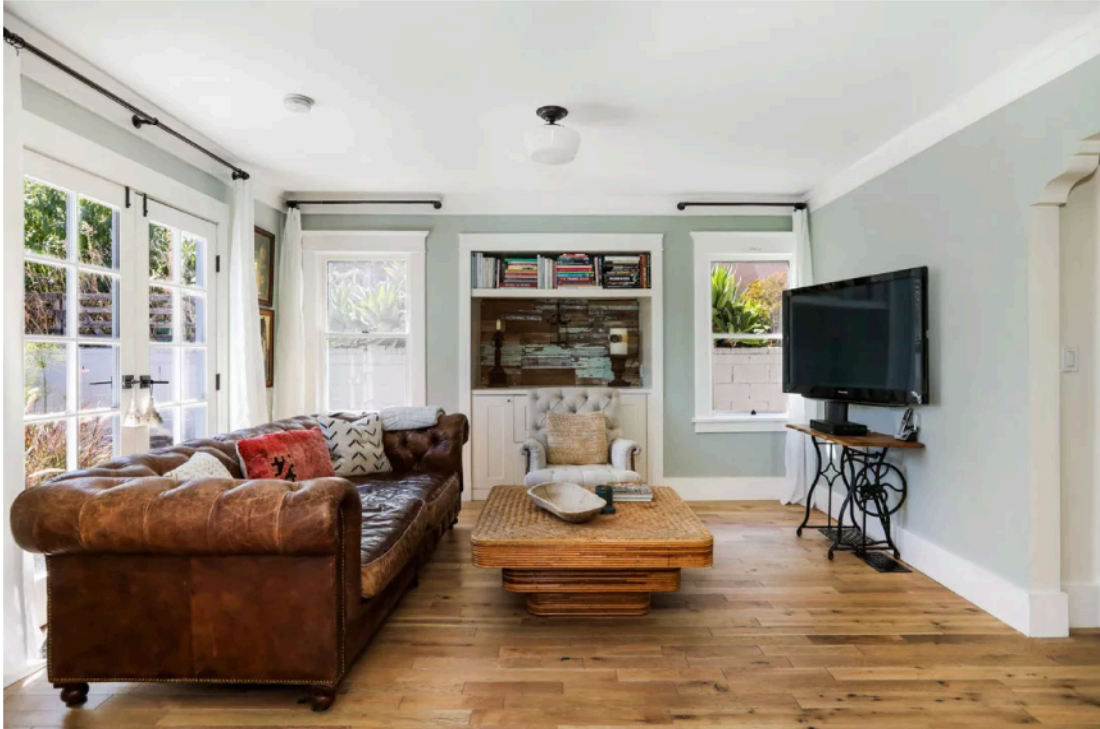
The living areas have an open floor plan.

There's also some outdoor space in the rear, where the washer and dryer are located.