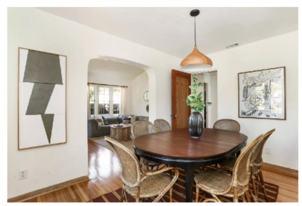
The living room, dining room, and kitchen flow together via pass-throughs.