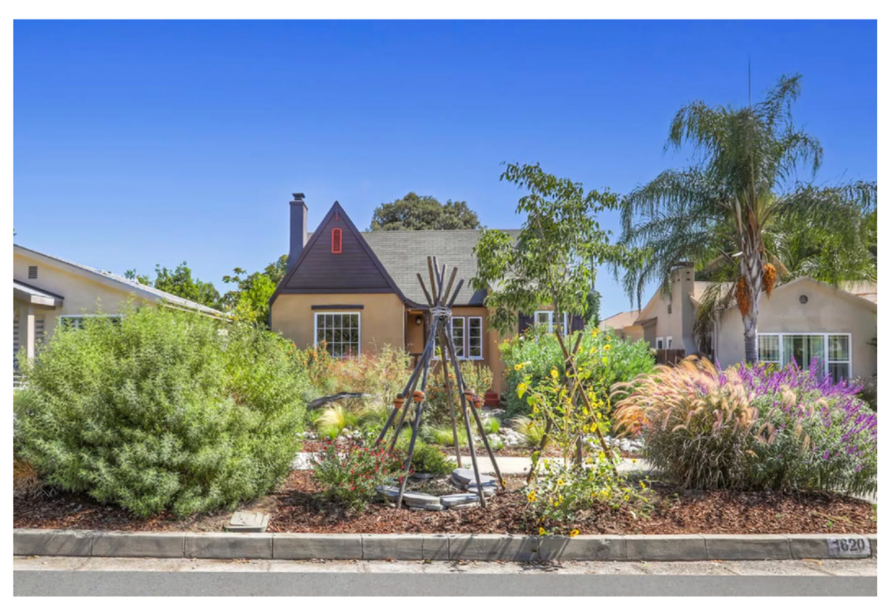
Forest Avenue is a pristine street with mountain views.