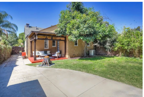
The lot measures 5,796 square feet.

\underline{https://la.curbed.com/2019/10/16/20913937/house-for-sale-two-bedrooms-tudor-pasadena}