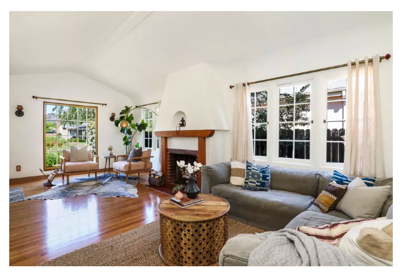
The hardwood floors, multi-pane windows, pitched ceiling, fireplace are original.

The one serious drawback of 1620 Forest Avenue might be its close proximity to the 210 Freeway. Last sold in 2004 for $450,000, it's listed at $770,000 with Tracy Do and Elias Tebache of Compass.