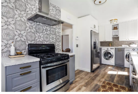
The kitchen was remodeled with a tile backsplash and stainless appliances.